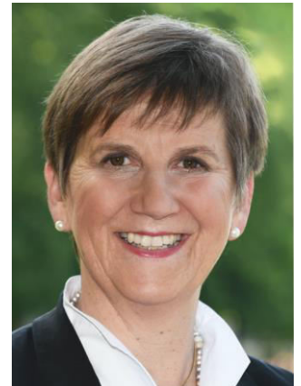
Mitglied des Deutschen Bundestag